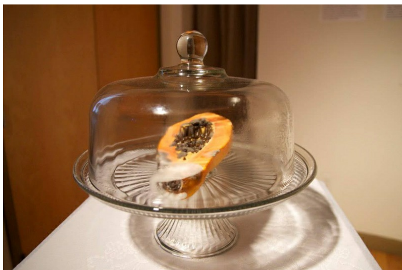
La fruta. La mia. mixed media installation. 2014.

Systems of oppression tell us we are not enough, that we don't have or deserve agency, that we should keep quiet and accept what is imposed onto us. And it is powerful when we claim ownership of our voice and agency. This is why the phrase "you are enough" is so radical. I think that's why a creative practice is important: it strengthens your creative voice and your agency.