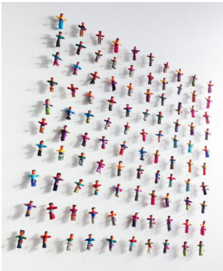
Wall of Worry , from "Saturnalia" Group show. December 2012. Candita Clayton Gallery. Pawtucket, Rhode Island.

Getting too abstract or conceptual! I struggle with that. But a good practice is to let go and write whatever comes to mind, and then add structure. Otherwise, I won't ever write, and I'll overthink it. I also have trouble finishing writing projects! I'm working on that. I just published my first young adult novel titled Naty and My Chaotic Stench! It's my second book, but this time it's published by Anomalous Press . It's a beautiful book and very meaningful to me, as it's a magical realism story set in my rural town in Puerto Rico.