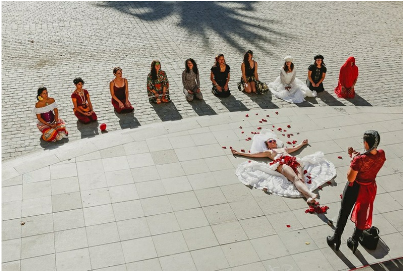
ALTAR A LO FEMENINO. SANTIAGO, CHILE. MARCH 2017

At AS220, code switching was my entire job! I had to talk to people from many different sectors: city, state, and local government, corporate and/or foundation funders, city planners, artists of all ages and intersections of identity, local residents who didn't consider themselves artists. It was all about connecting with people who perhaps didn't see the world in the same way. Still today, I get to meet many different people and open conversations that can lead to powerful collaborations.